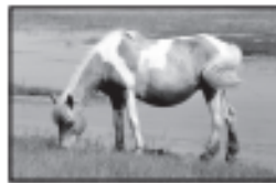
Wild Horses of Assateague Island.